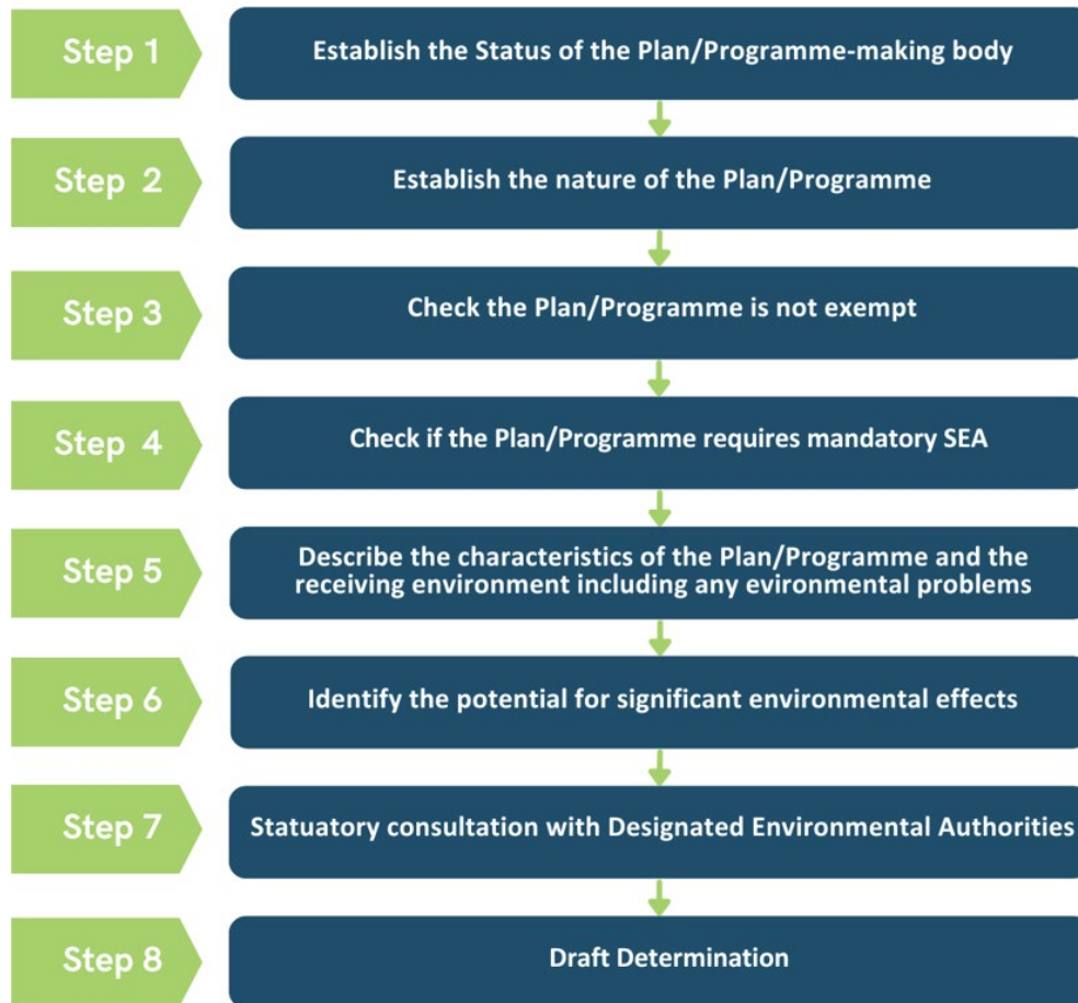
Figure 1-1: SEA Screening steps as per the EPAs Good Practice Guidance on SEA Screening

The second environmental significance criterion refers to the characteristics of the effects and area likely to be affected, having regard to; the probability, duration, frequency and reversibility of the effects; the cumulative nature of the effects; the transboundary nature of the effects; the value and vulnerability of the area likely to be affected due to special natural characteristics or cultural heritage, exceeded environmental quality standards or limit values or intensive use; the effects on areas or landscapes which have a recognised national, European or international protection status.